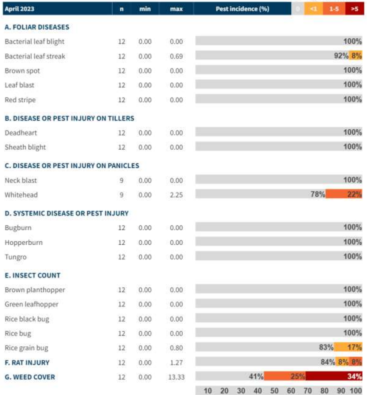
Figure 4. Incidence of pest injuries, counts of insect pests, and weed cover in Quezon on April 2023. Horizontal bar shows the proportion of fields in each range of pest injury incidence, insect count or weed cover.