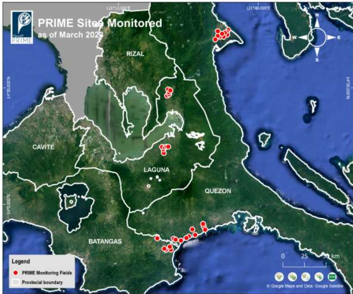
Figure 1. PRIME monitoring fields in Region IV- A CALABARZON as of March 2023.